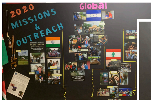
Global (left) and Local (right) missions boards.

Thanks for your prayers for our mission work here in St. Louis and around the World. We are learning to serve the Lord right where we are while continuing to moving forward in His Spirit at the same time!