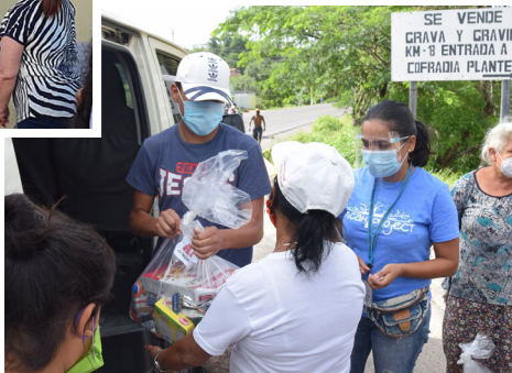
Handing out food in Honduras.