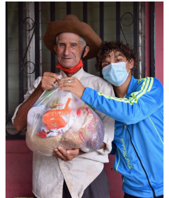
Micah boy sharing food.

In Missions & Outreach here at Central, God has been moving us forward as well. We have seen wonderful ministry opportunities locally with sharing food boxes with those in need. Our Harvest Ministry has ministered to their refugee and immigrant friends. Several members are preparing to do a local outreach concert and event for Sunshine Ministries in the city. And even globally, while we couldn't travel, I had the opportunity to do "Zoom" interviews with several of our missionaries in Honduras, Hungary, Israel, Portugal, Kenya and Iraq.