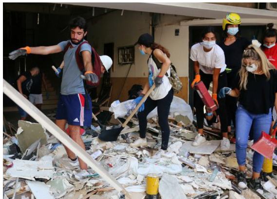
Clearing away rubble in Lebanon.

For me personally, I feel great loss in not seeing friends and family as I would like. Every single mission trip for 2020 was cancelled and I have not been able to say goodbye to dear friends around the world as I prepare to retire in Dec. I hope that 2021 will allow me to see some of them again.