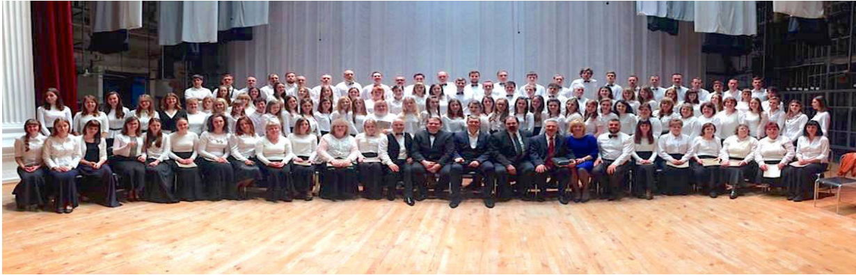
The choir on stage in Ukraine

Over the past few years, many have responded to follow Christ. Please pray for the effectiveness of this outreach and for God to touch many more as we reach out this September in the nation of Ukraine.